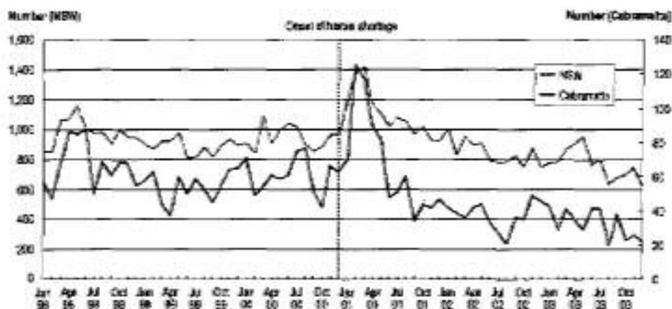
Figure 2: Trends in robbery, NSW and Cabramatta